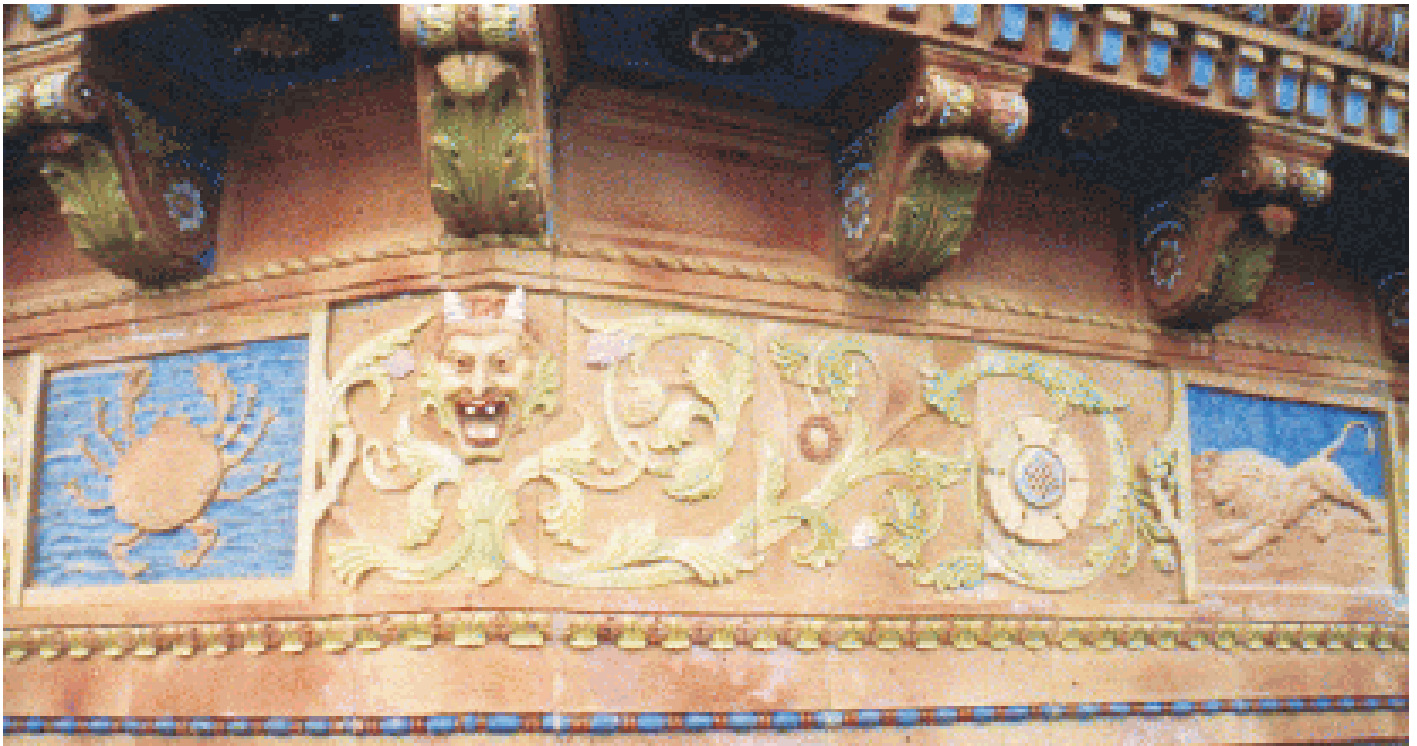
PHOTO, ABOVE: Dozens of custom Aquathane UA210 NCL colors were used to restore decorative terra cotta elements at this Florida museum.