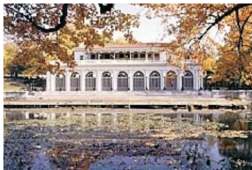
PHOTO: Restoration of this historic terra cotta boathouse included use of Elastowall 351 to match the original terra cotta glaze.

□ Environmental: VOC<250 g/l, complies with EPA regulations for architectural coatings.