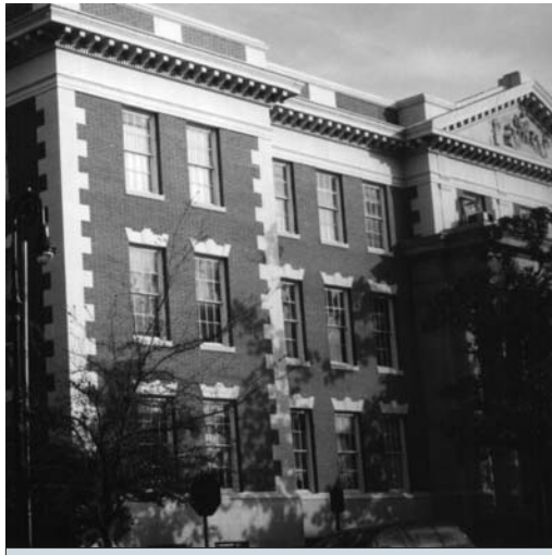
PHOTO: Ten years after being coated with Elastowall 351, limestone elements on this historic school retain a crisp, natural appearance.

Their combination of high permeability, outstanding exterior durability, and permanent low temperature flexibility make the 350-Series the coatings of choice for the most demanding applications. Advanced waterborne formulation represents the state of the art in handling convenience, safety, low odor and low VOC. The result is a high-performance coating system that is both user and environmentally friendly.