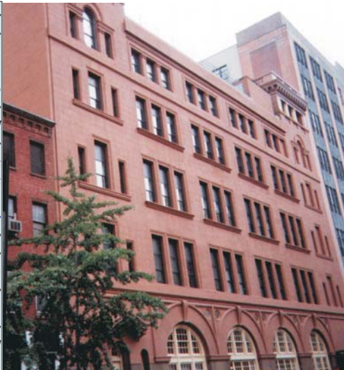
PHOTO: After patching and stone replacement, ELASTO-TONE 353 , color-matched to the original stone color, was applied to the entire facade of this New York City Landmark building. ELASTO-TONE provided a highly permeable aesthetic finish which visually blended repairs, replacement stone and original fabric.

ELASTO-MASTIC 352 and ELASTO-FILL 354 are not replacements for proper expansion joint sealants. Joints, windows, vents and other penetrations should be caulked with suitable polyurethane sealant.