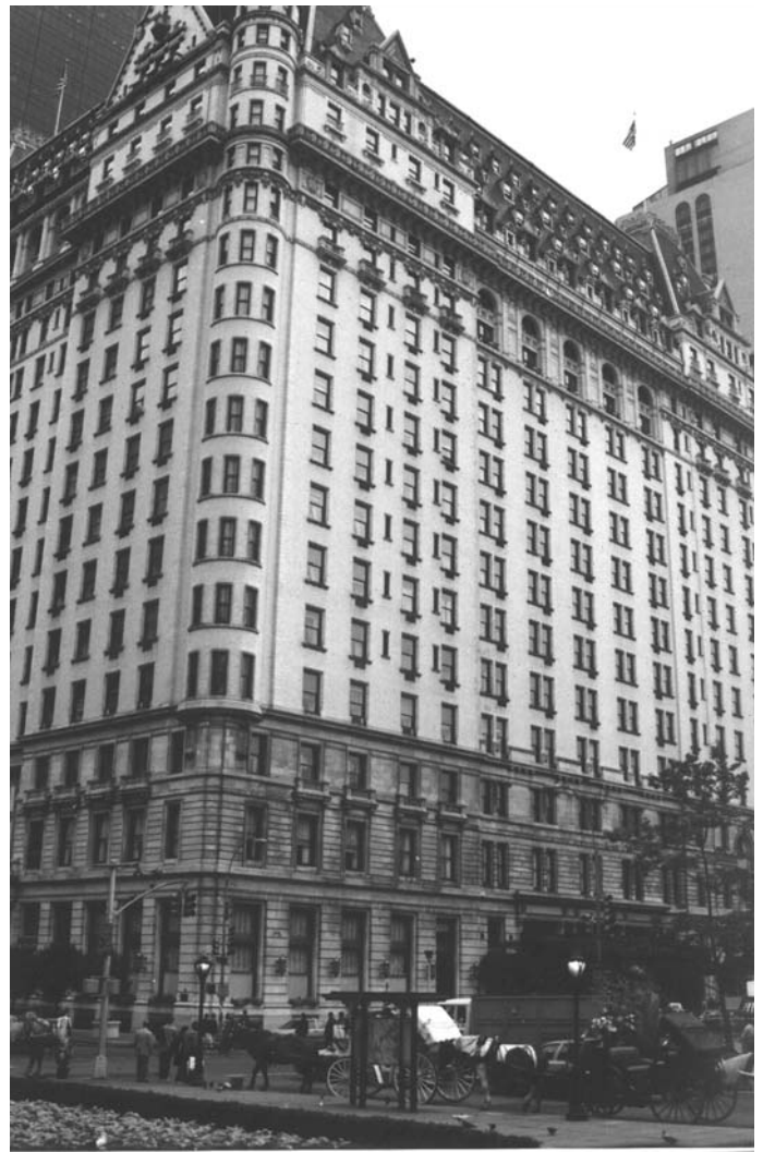
Custom Color Stain