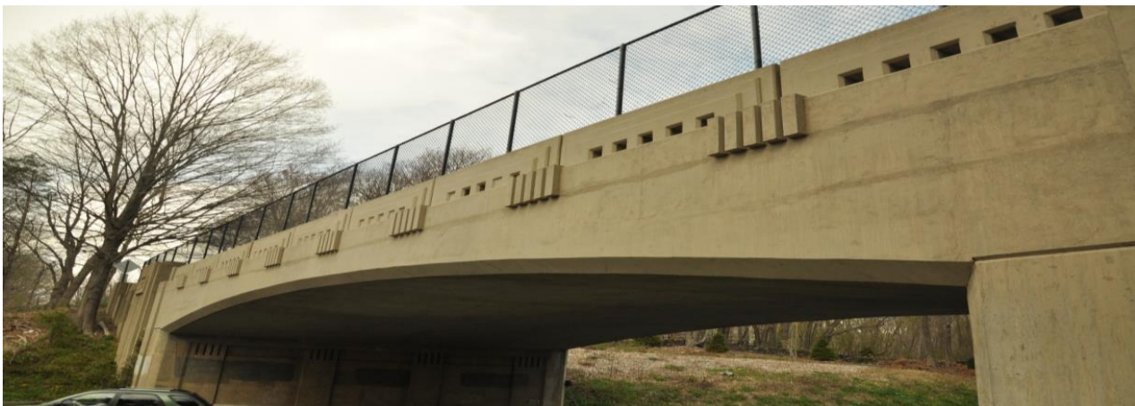
Photo: Merritt Parkway, Trumbull, CT. EverKote 300 Patinar application over new concrete to match historic color.