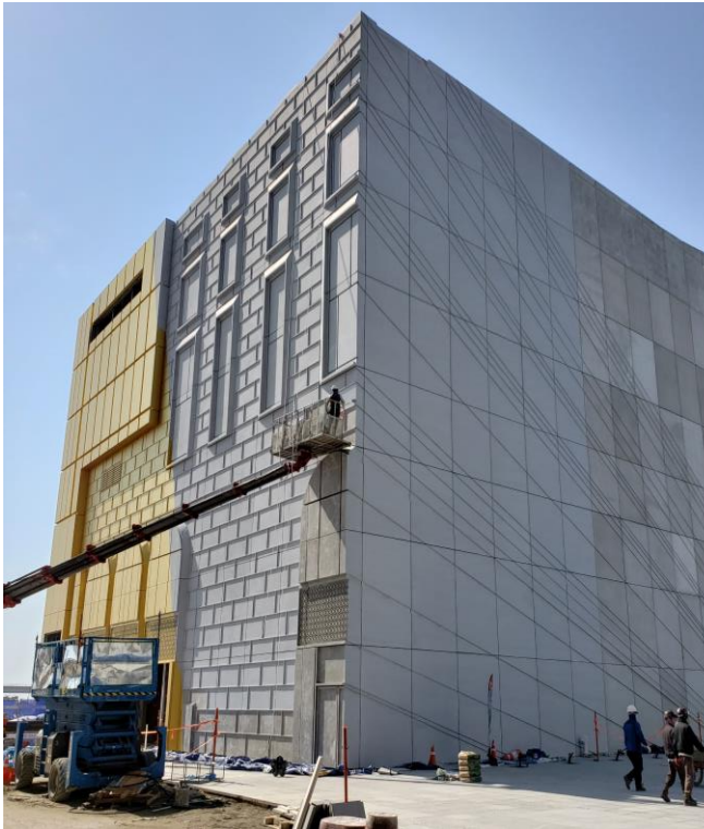
Photo: EverKote 300 Patinar during installation over custom pre-cast concrete panels.

Reactive Inorganic Mineral Paints & Stains