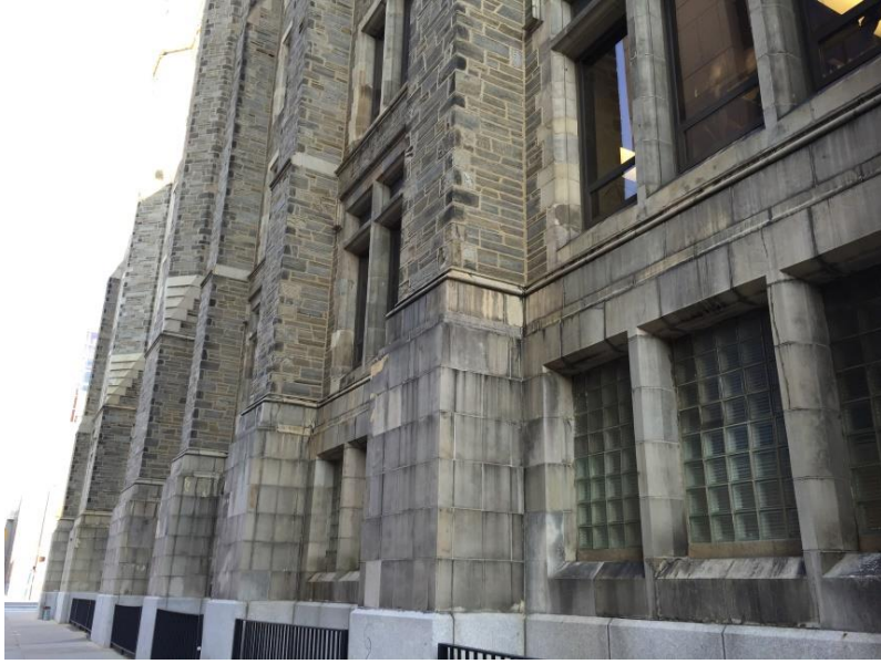
Conwell Hall, before restoration