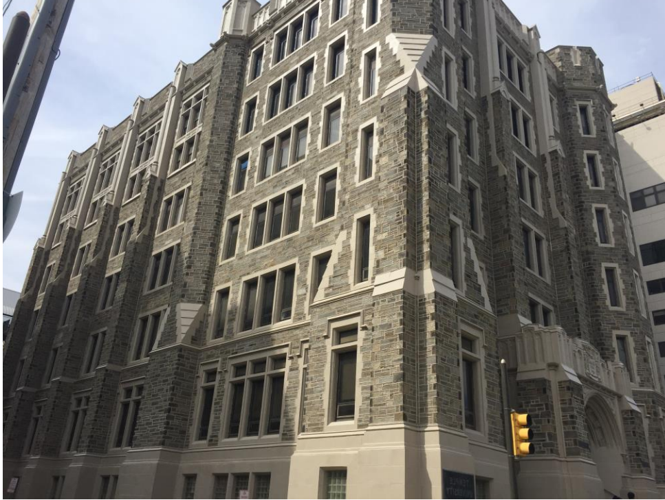
Conwell Hall, restoration complete.